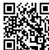
Application Form of Guardian Pass